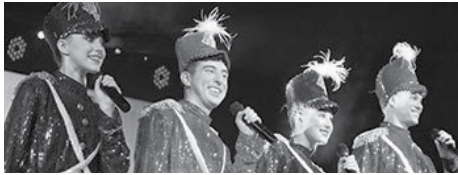
Re-Creation Christmas Show December 4 | 2pm & 7pm