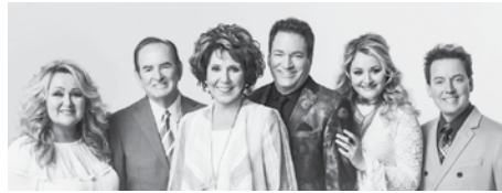
The Hoppers Christmas Concert December 5 | 2pm & 7pm